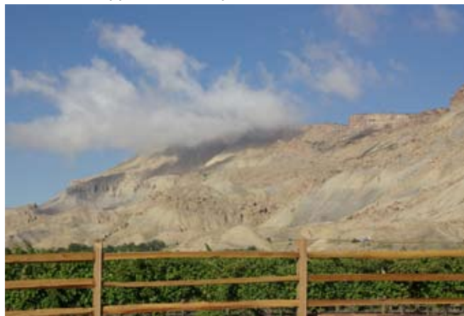
The vineyard on the property of the Wine Country Inn, an eight room inn located in the Palisade wine country of Colorado