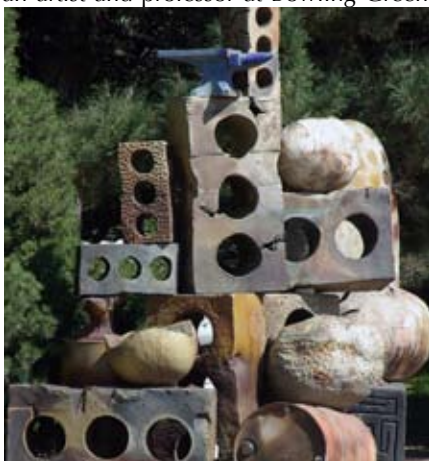
Sculpture created by a son for his father's winery

University. He provided the sculptures seen in the landscaping.