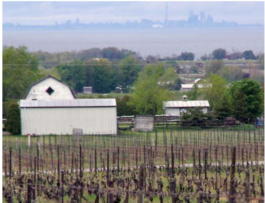
Cave Spring Cellars Vineyard is close to the south shore of Lake Ontario. Toronto is across the lake.